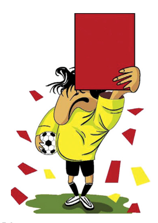
FIGURE 4 Red card for severe improper behavior. (Color figure available online.)